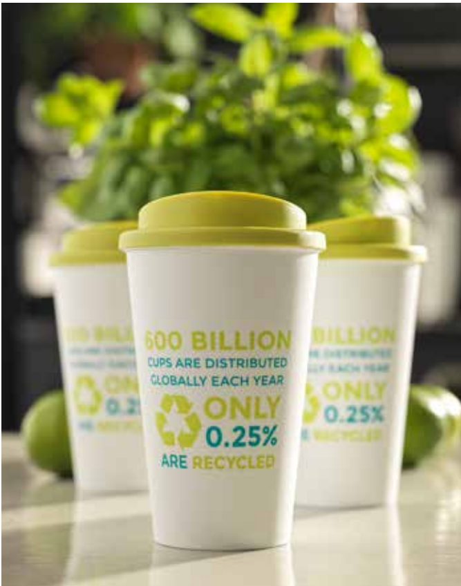
210001 AMERICANO® 350 ML INSULATED TUMBLER