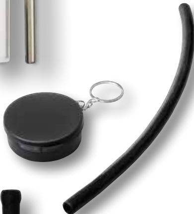
100573 RHINE REUSABLE SILICONE STRAW KEY- CHAIN