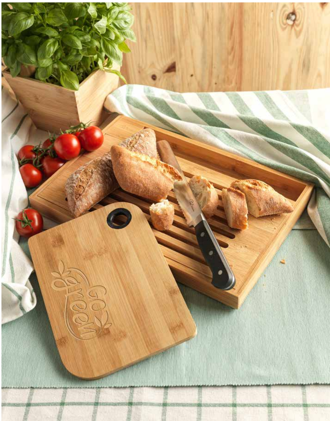
112873 MAIN WOODEN CUTTING BOARD