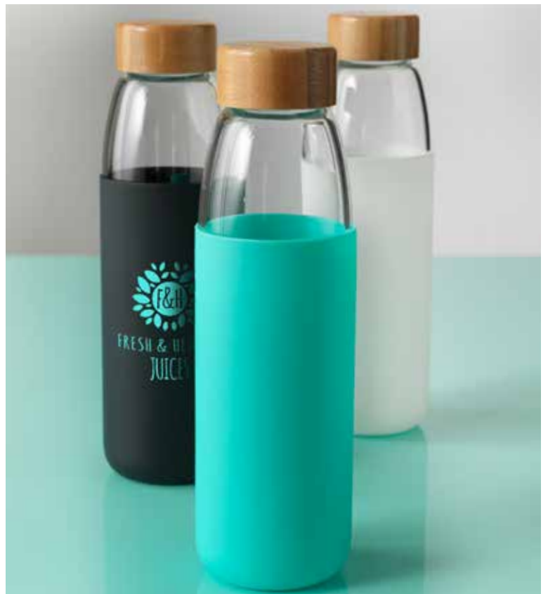
100550 KAI 540 ML GLASS SPORT BOTTLE WITH WOOD LID