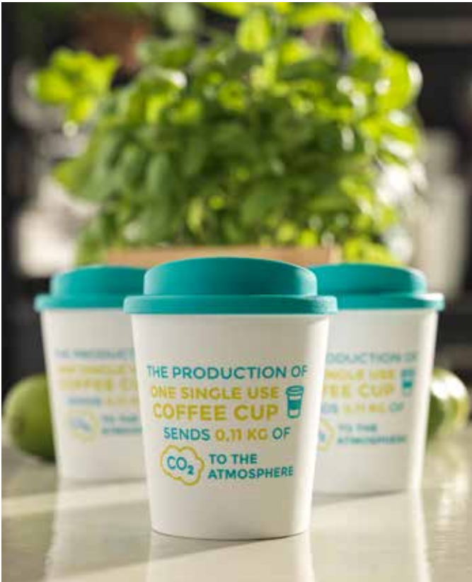
210092 AMERICANO® ESPRESSO 250 ML INSULATED TUMBLER