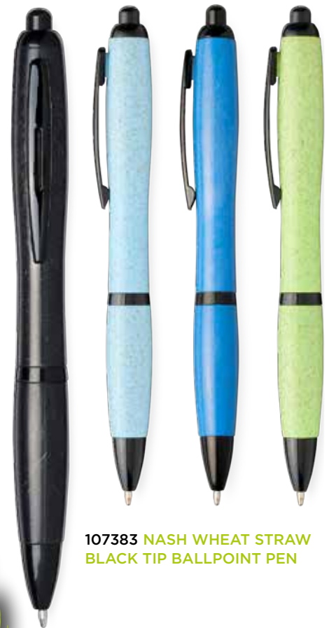
107383 NASH WHEAT STRAW BLACK TIP BALLPOINT PEN