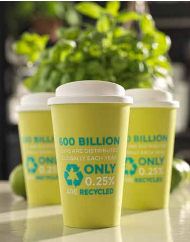
210001 AMERICANO® 350 ML INSULATED TUMBLER