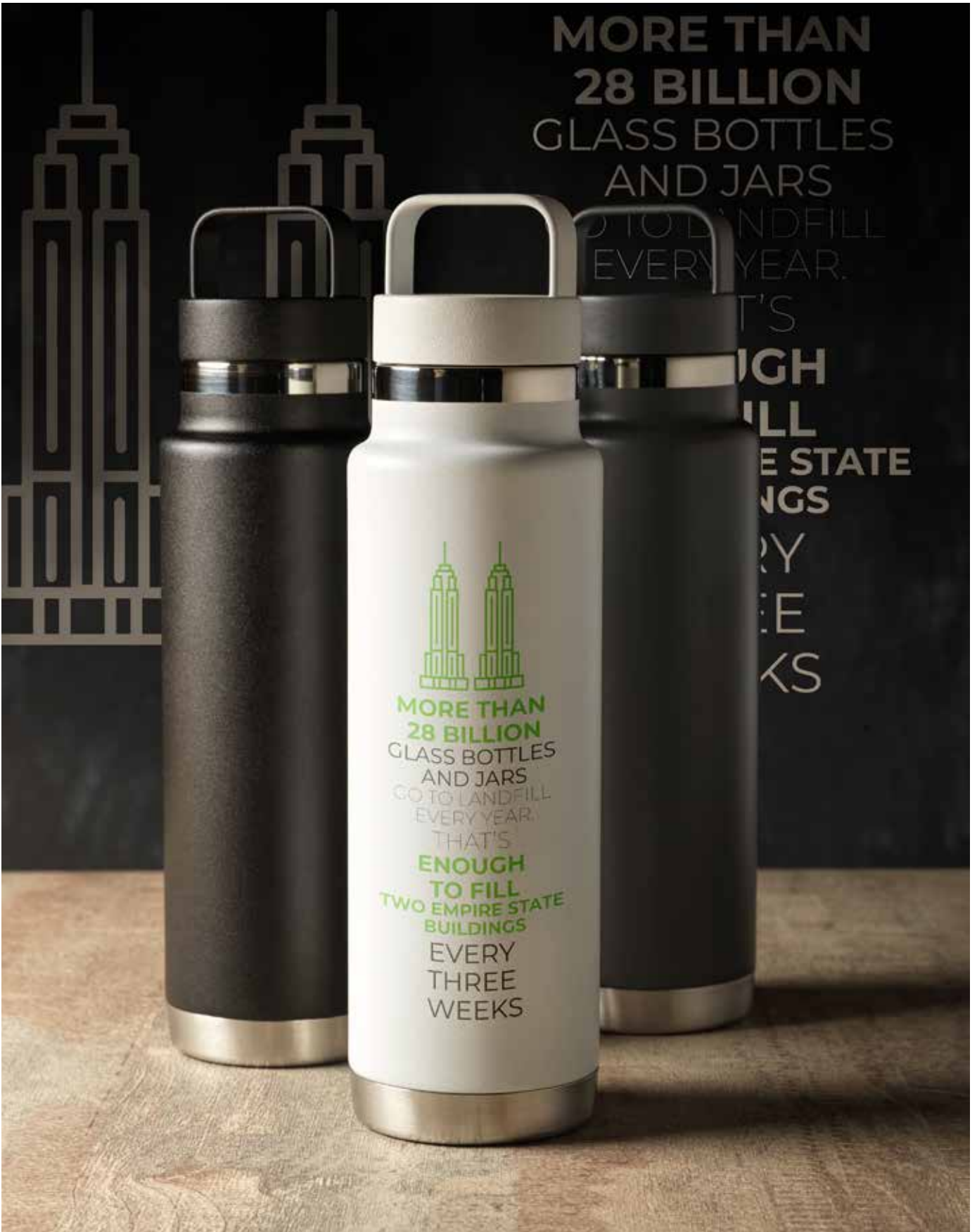
100590 COLTON 600 ML COPPER VACUUM INSULATED SPORT BOTTLE