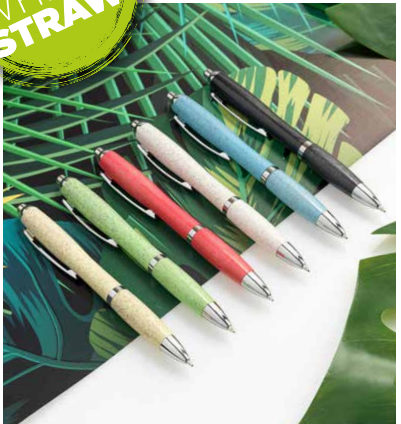
107379 NASH WHEAT STRAW CHROME TIP BALLPOINT PEN

WHEAT STRAW IS THE LEFT OVER STALK AFTER WHEAT GRAINS ARE HARVESTED, WHICH REDUCES THE AMOUNT OF PLASTIC USED BY ARROUND 50%