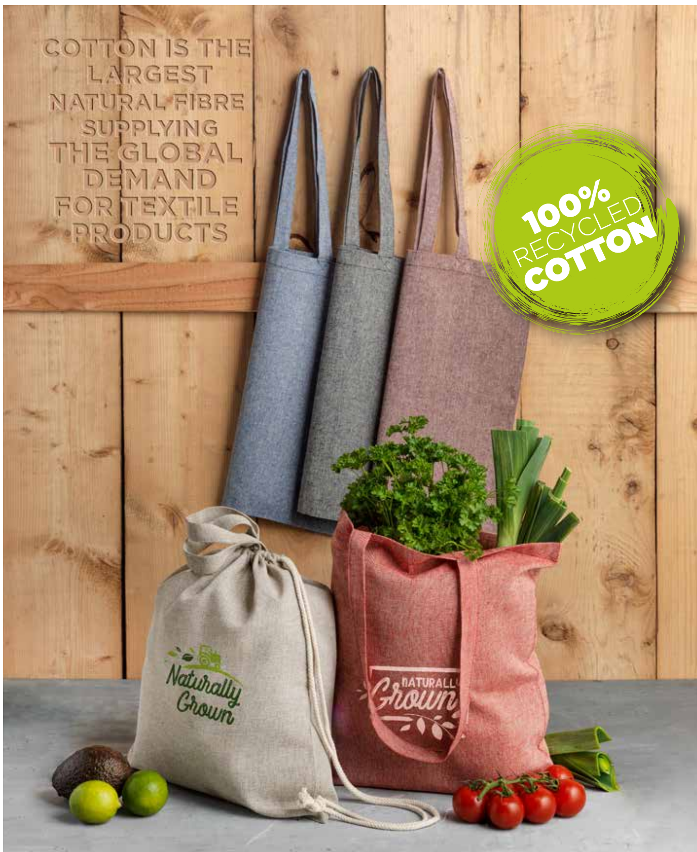
120459 140GSM DRAWSTRING BAG RECYCLED COTTON