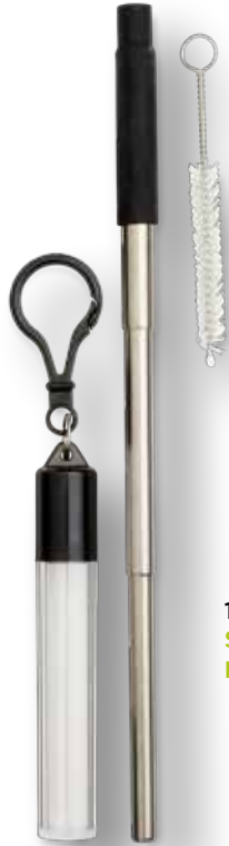
100586 ZEYA REUSABLE STAINLESS STEEL STRAW KEYCHAIN

GLASS IS 100% RECYCLABLE AND CAN BE RECYCLED ENDLESSLY WITHOUT LOSS IN QUALITY OR PURITY