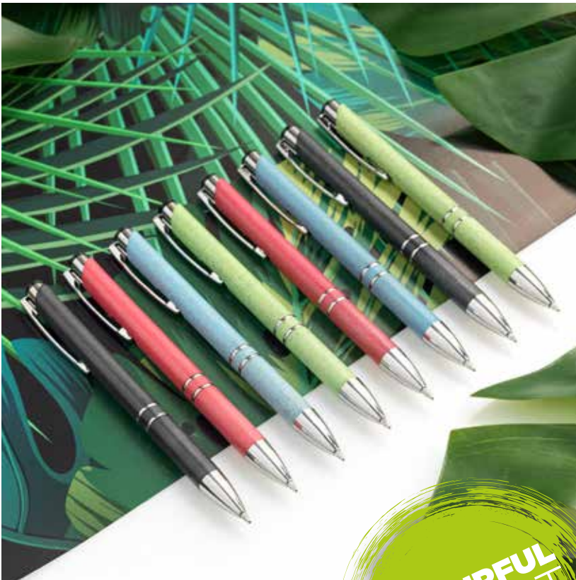
107382 MONETA WHEAT STRAW BALLPOINT PEN