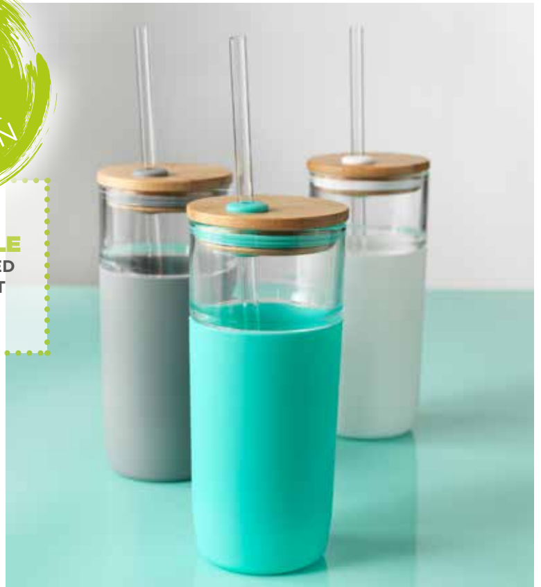
100486 ARLO 600 ML GLASS TUMBLER WITH BAMBOO LID