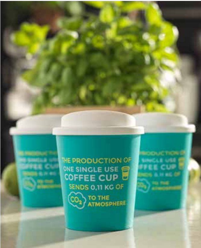
210092 AMERICANO® ESPRESSO 250 ML INSULATED TUMBLER