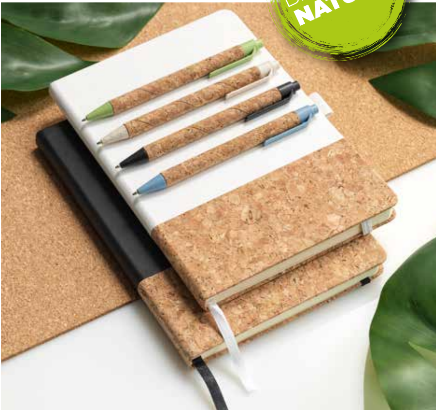
107385 MIDAR CORK AND WHEAT STRAW BALLPOINT PEN