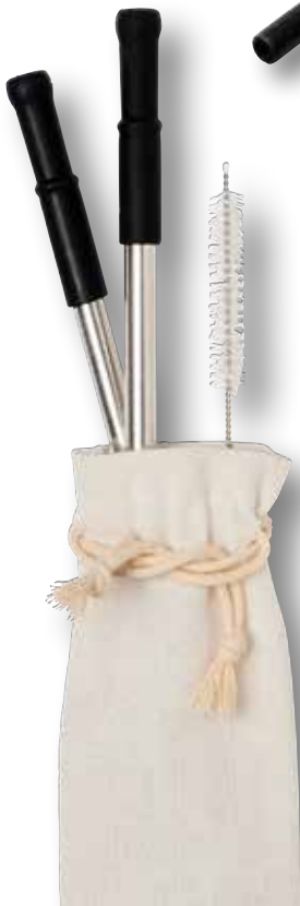
100574 LENA REUSABLE STAINLESS STRAW SET